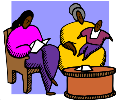
Let your child see you reading.

All babies develop at different rates. Your four month old is growing and developing in so many ways. He is learning to use his hands to move and hold objects. Your baby is developing language. Young babies make sounds that imitate adult talk; they "read" the gestures and facial expressions of their caregivers. Playful and informal language exchanges with a caring adult help develop the language part of his brain and with that come better thinking skills. Your baby can actually become smarter while you are having fun together.